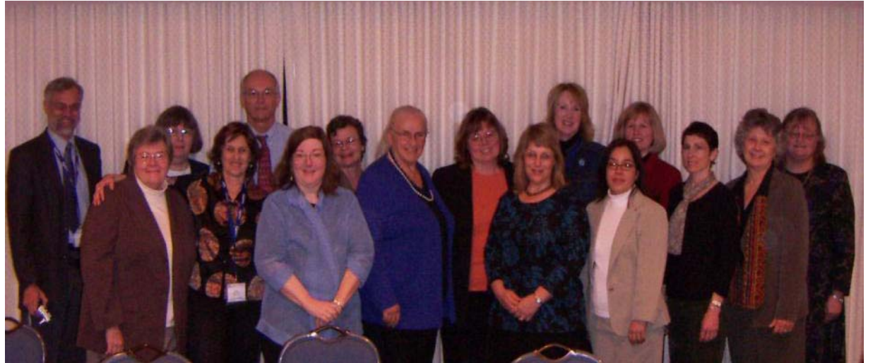
Members at Meetings